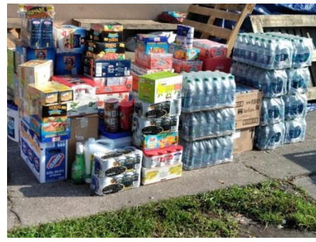
Food supplies unpacked