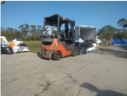
Clothing and bedding placed on 7 pallets