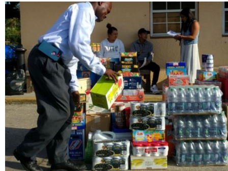
Local priest stacks MM food supplies