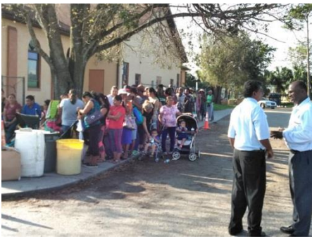
Crowd waits for supplies